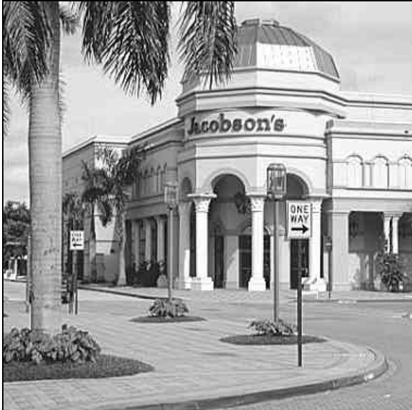
Retail buildings defining a Main Street